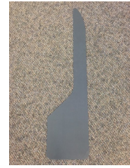
Long John Mud Flap Passenger's Side (1)