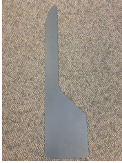
Long John Mud Flap Driver's Side (1)