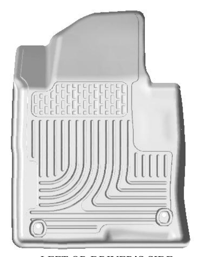
LEFT OR DRIVER'S SIDE