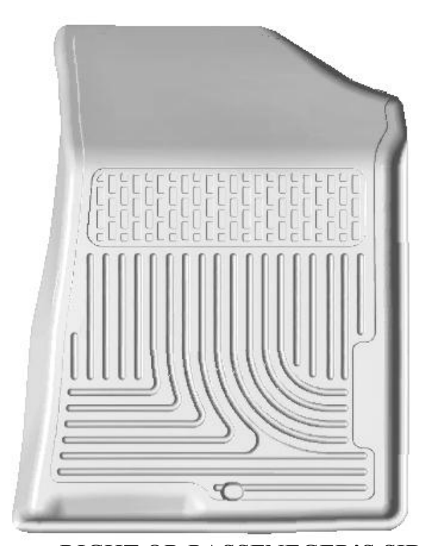
RIGHT OR PASSENEGER'S SIDE

TO EASE INSTALLATION OF YOUR SONATA FRONT FLOOR LINERS, FIRST SLIDE BOTH FRONT ROW SEATS ALL THE WAY BACK TO EXPOSE THE FRONT FLOOR PANS. ONCE YOU HAVE INSTALLED THE FRONT LINERS, REPOSITION THE FRONT SEATS AS DESIRED. NOTE THAT DRIVER'S SIDE LINER ATTACHES TO THE FACTORY MAT RETAINING HOOKS LOCATED IN THE DRIVER'S SIDE FLOOR PAN.