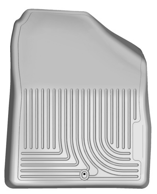
LEFT OR DRIVER'S SIDE