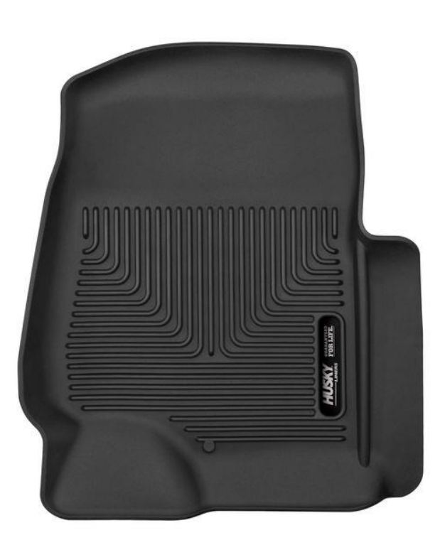
RIGHT OR PASSENGER

TO INSTALL DRIVER'S SIDE LINER SIMPLY POSITION LINER OVER EXISTING RETAINER AND PRESS DOWN TO SEAT LINER OVER THE RETAINER. INCLUDED IN YOUR PACKAGING IS AN ADDITIONAL RETAINING POST FOR THE PASSENGER SIDE. SEE INSTALLATION DETAILS ON THE BACK OF THIS PAGE.