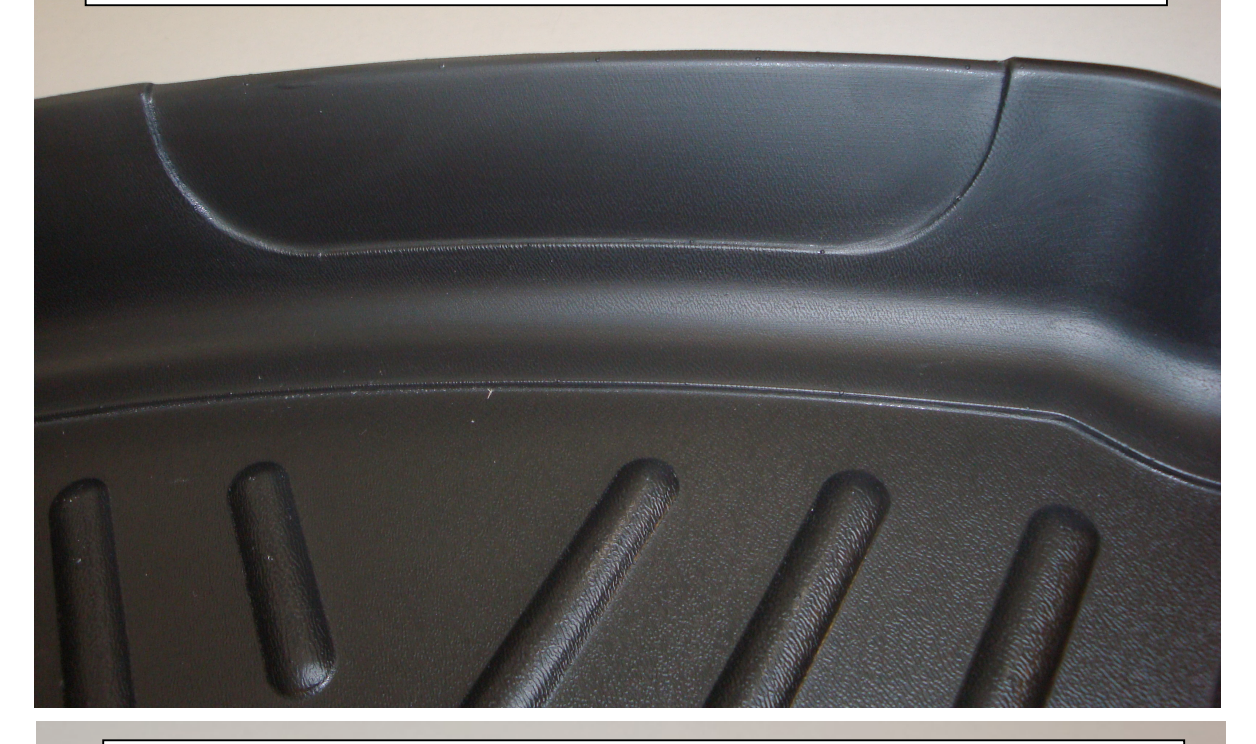
PHOTO SHOWING PART #42051 TRIMMED TO ALLOW ACCESS TO CARGO HOOK AND CARGO NET RETAINER.