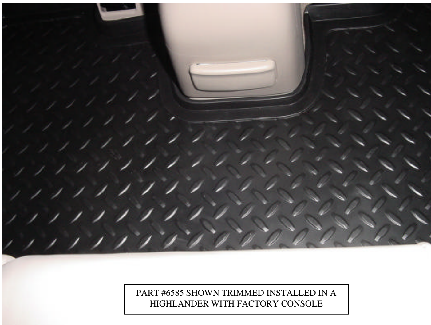
PART #6585 SHOWN TRIMMED INSTALLED IN A HIGHLANDER WITH FACTORY CONSOLE