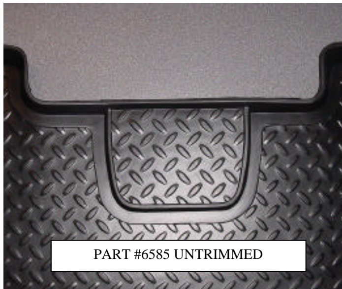
PART #6585 UNTRIMMED