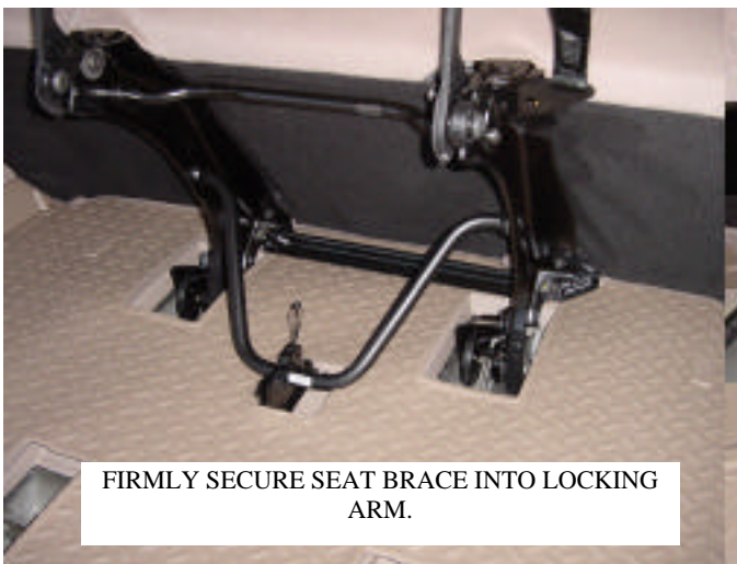
FIRMLY SECURE SEAT BRACE INTO LOCKING ARM.