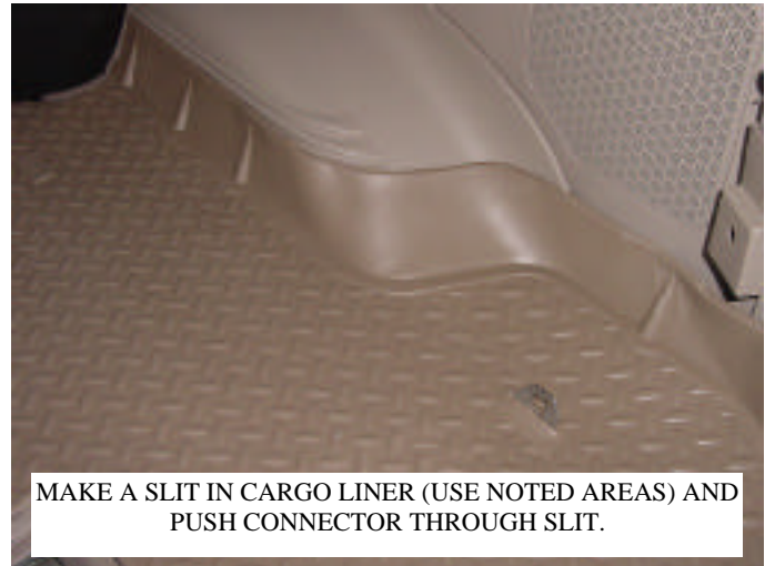
MAKE A SLIT IN CARGO LINER (USE NOTED AREAS) AND PUSH CONNECTOR THROUGH SLIT.