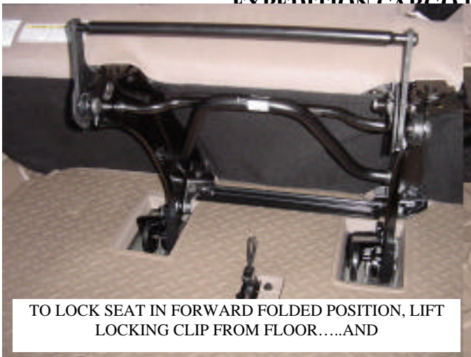
TO LOCK SEAT IN FORWARD FOLDED POSITION, LIFT LOCKING CLIP FROM FLOOR.....AND