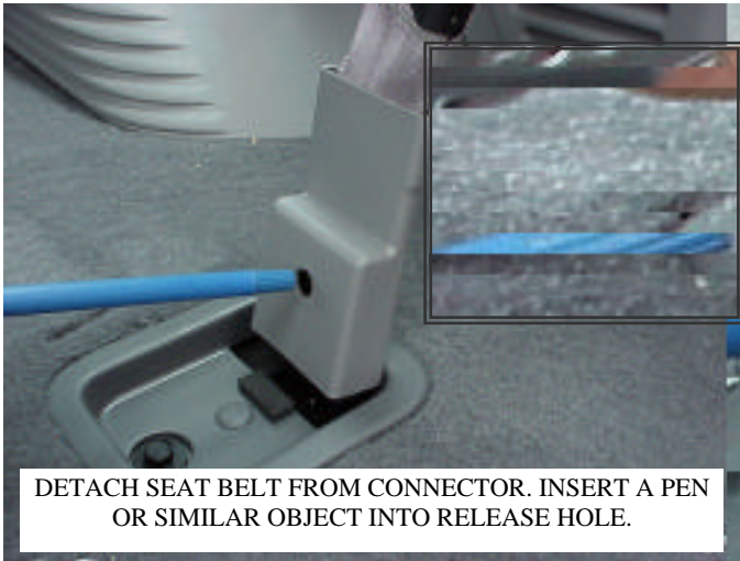
DETACH SEAT BELT FROM CONNECTOR. INSERT A PEN OR SIMILAR OBJECT INTO RELEASE HOLE.