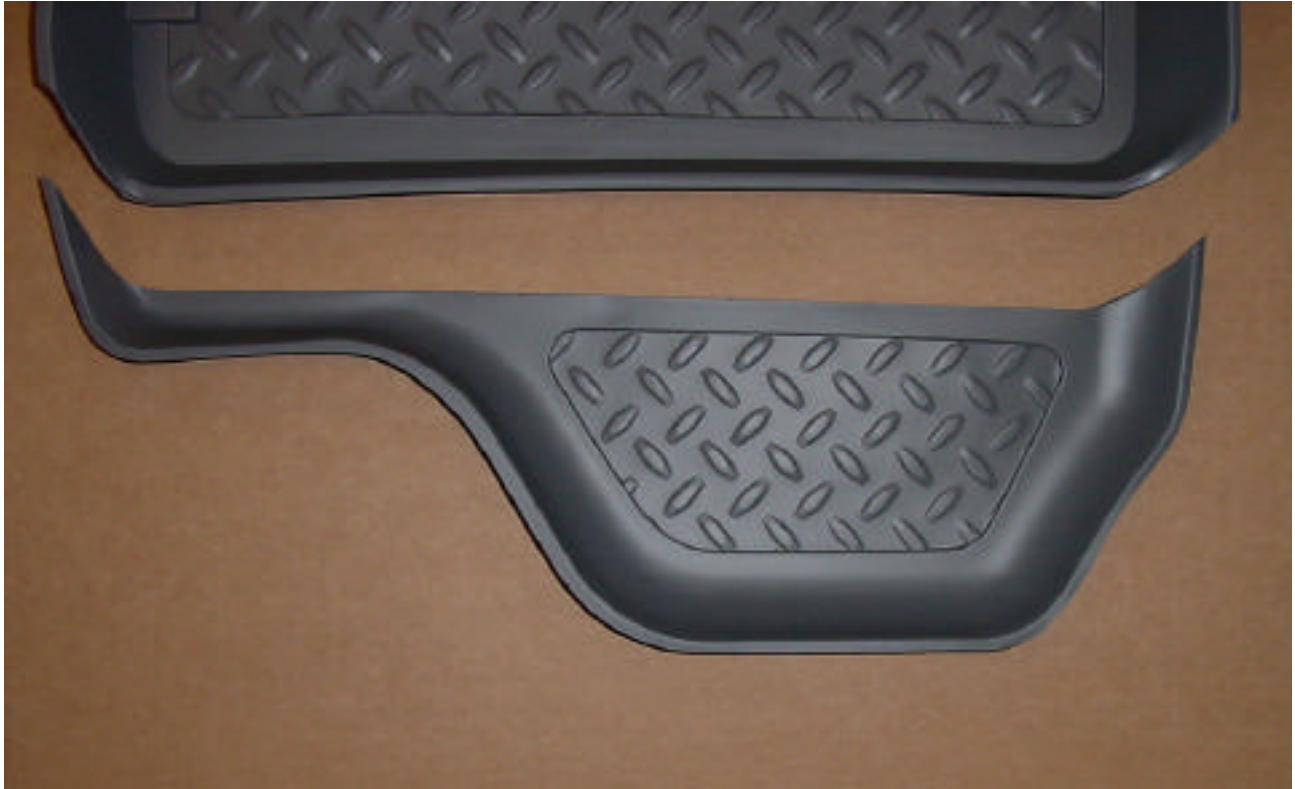
PHOTO OF 2179 TRIMMED FOR USE IN A 2001 DURANGO